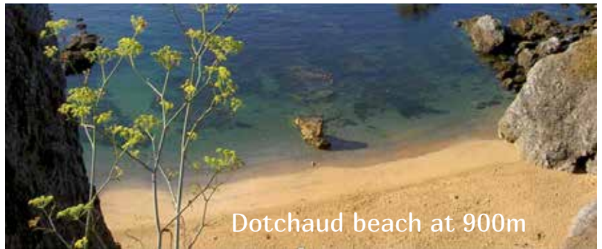
Dotchaud beach at 900m

Grand Village * 56360 Bangor Belle-île-en-Mer