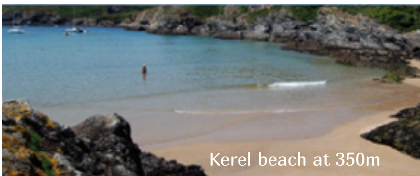
Kerel beach at 350m